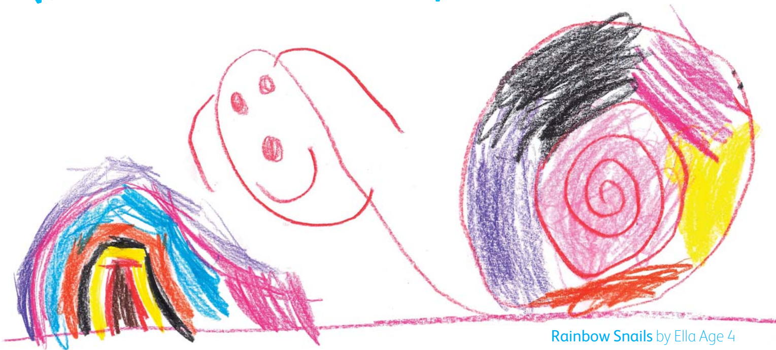
Rainbow Snails by Ella Age 4